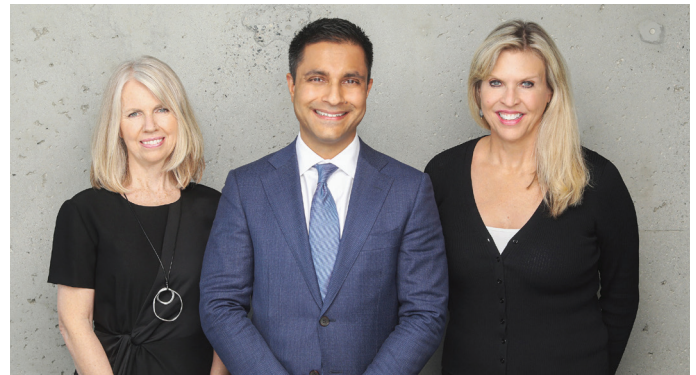
Gill Wealth Management Group TD Wealth Private Investment Advice